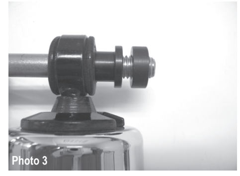
On 1991 - Later Sportsters also use one additional spacer in conjunction with the shouldered sleeve to provide sufficient space between the shocks and the Frame / Swing arm.