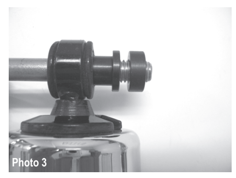
On 1991 - Later Sportsters also use one additional spacer in conjunction with the shouldered sleeve to provide sufficient space between the shocks and the Frame / Swing arm.